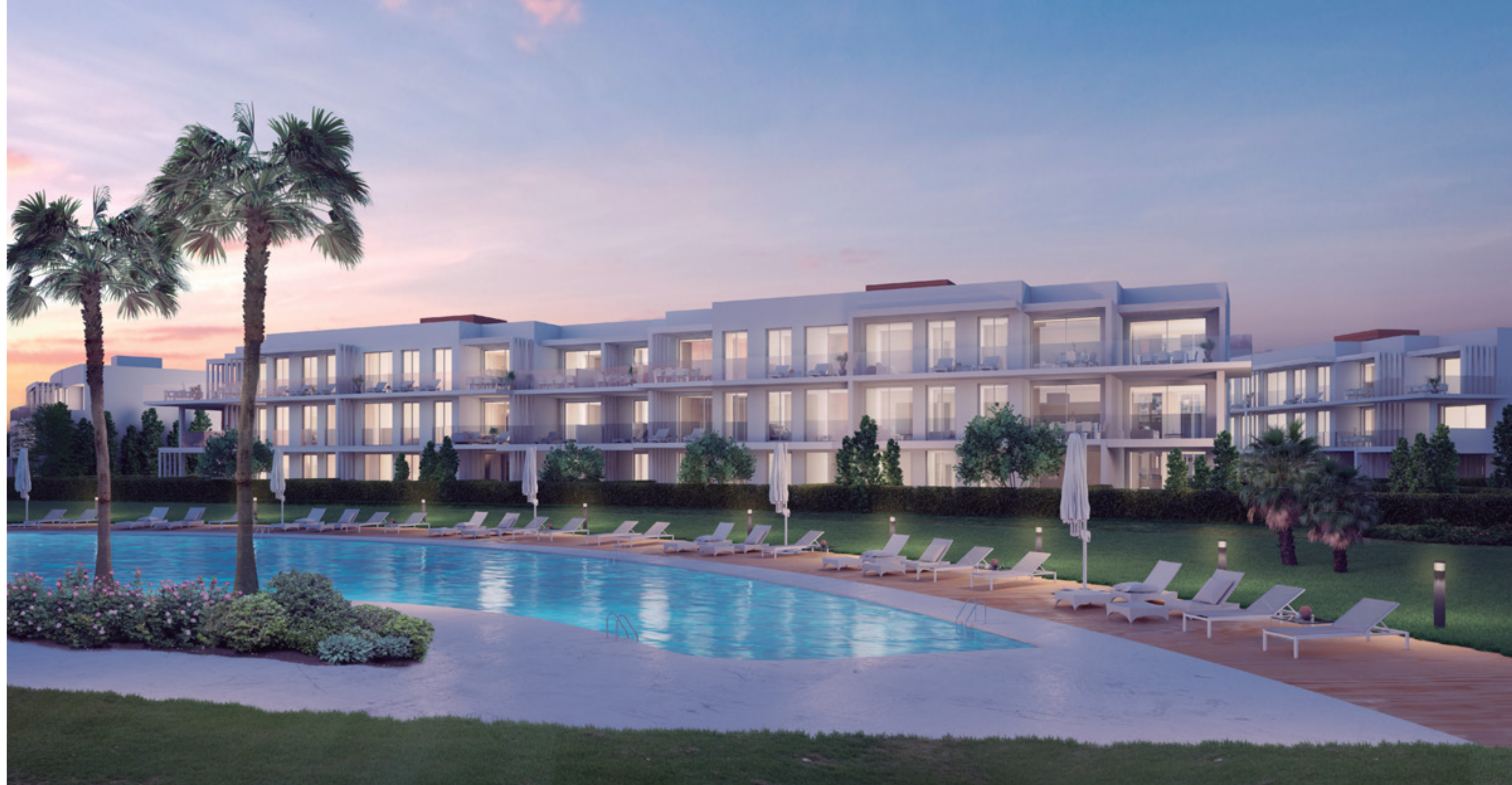
Image / Swimming Pool

Over 25,000 sq m of common areas with two main swimming pools, one children's swimming pool, locker room and toilets, 2 paddle tennis courts, one pétanque court and expansive gardens