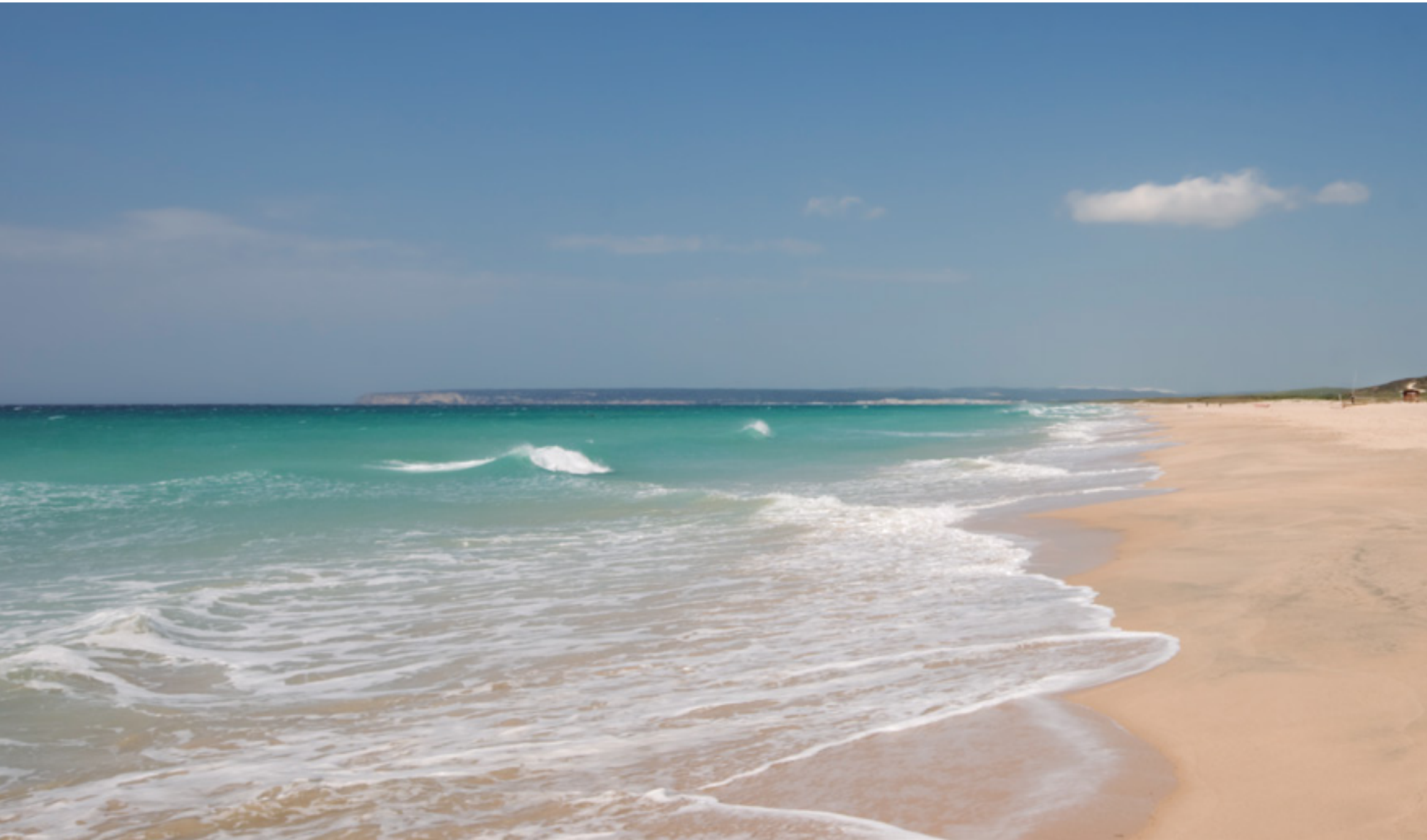
Image / Beach