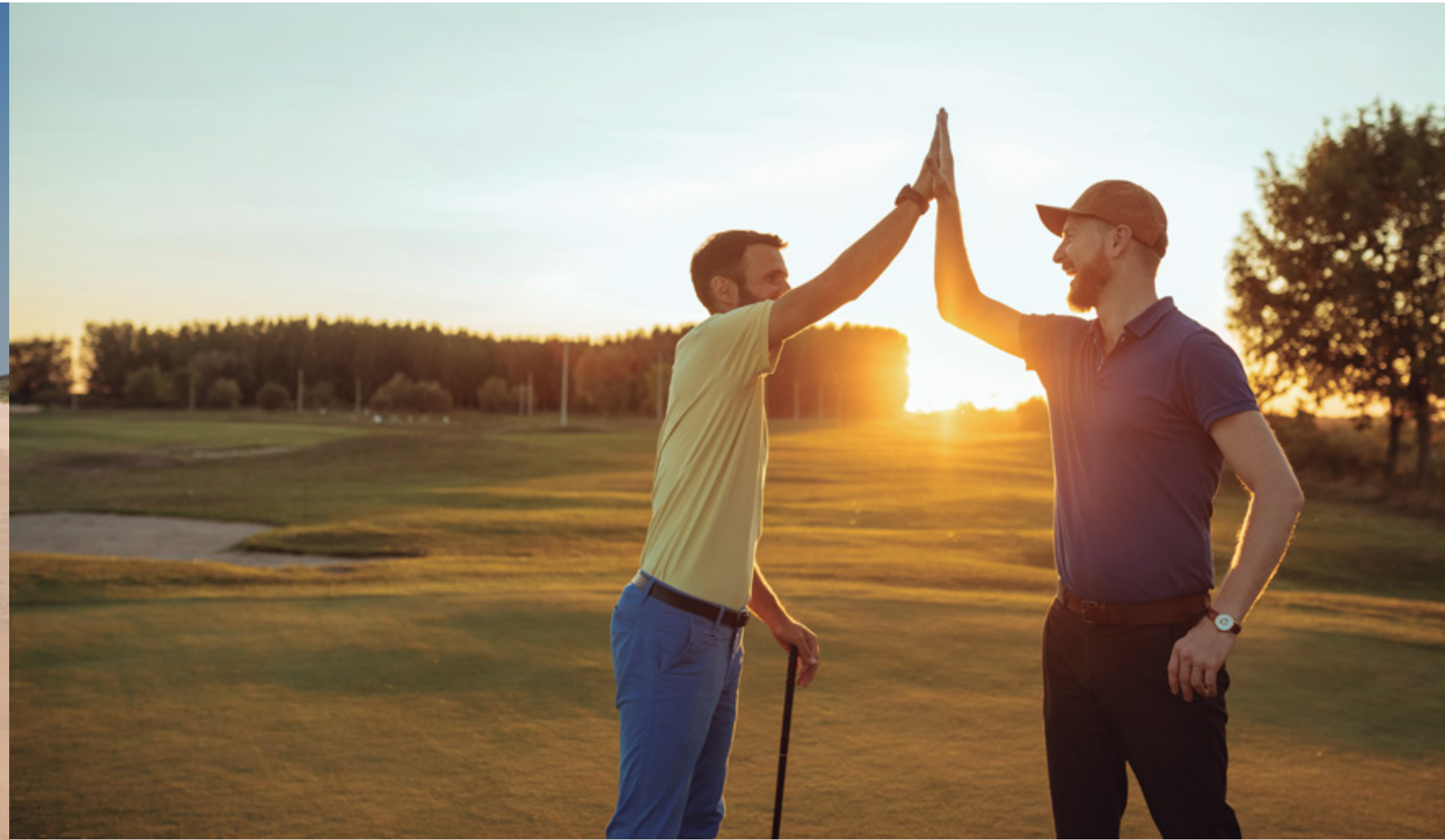
Image / Golf Course