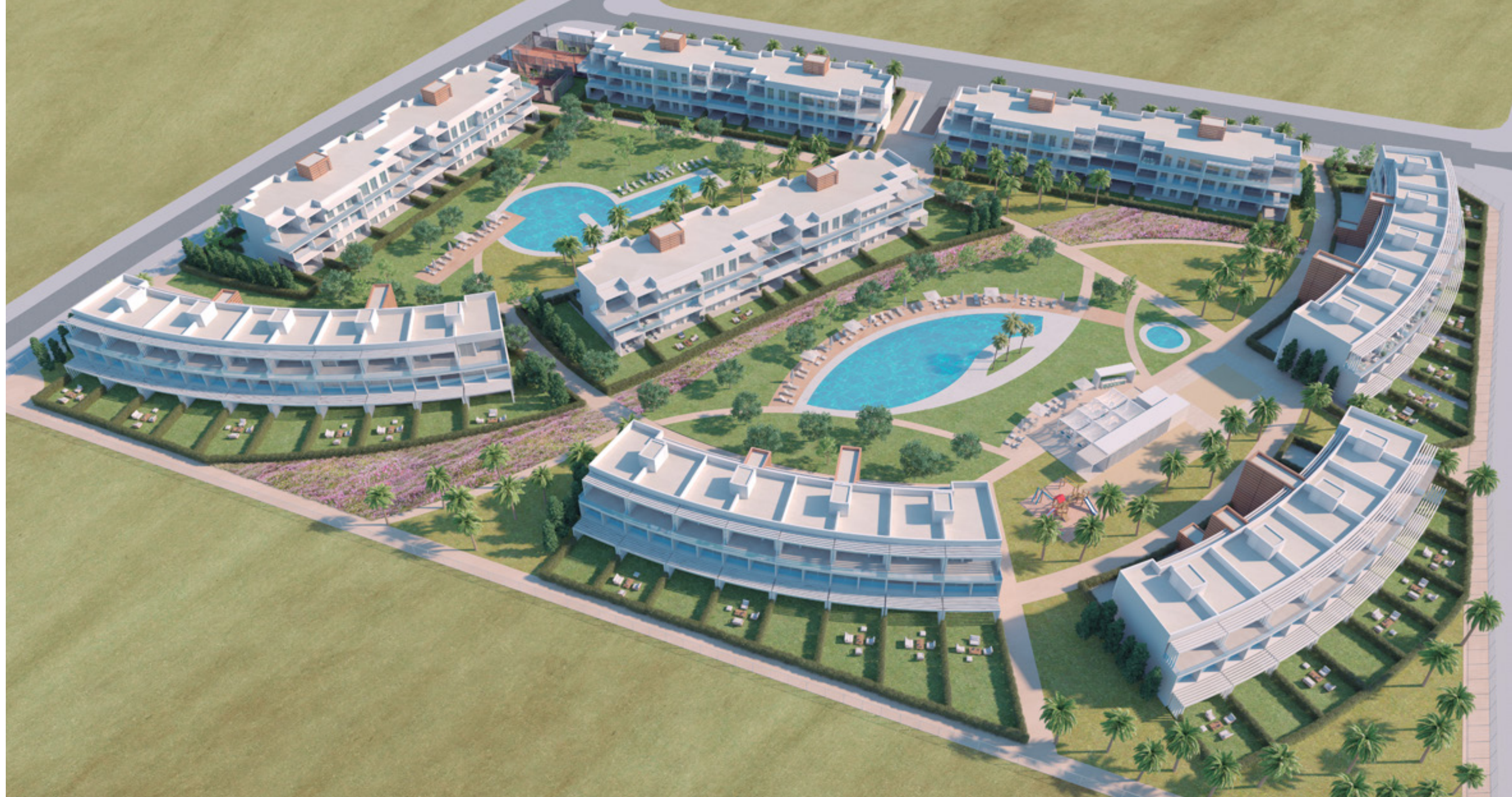
Image / Playa Azul Façade